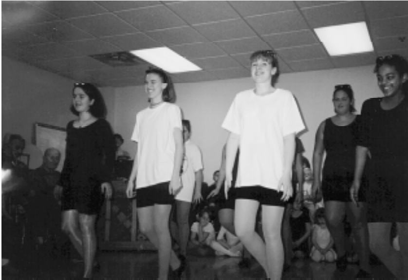
Family Center girls put on a show for seniors.

The primary means of implementing these approaches was through: