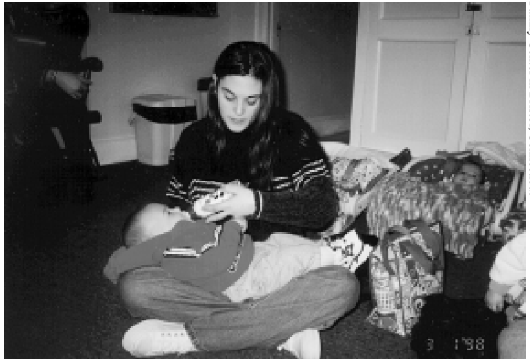
Family Center in Bristol, Connecticut

Frequently, typical adolescent stresses come to the fore—emotional stresses such as the need to establish an independent identity leading to conflicts with their own mothers and fathers; social affairs involving boy friends, best friends, and dating; and academic subjects involving future career choices. To address these concerns, trained Family Center staff provide case management and individual counseling. Close and