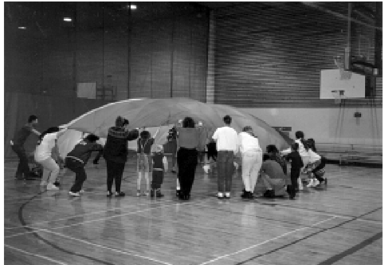
Family Focus Coalition and WSU/Spokane County Cooperative Extension

In response to this lack, the Girl Scout Council adopted innovative procedures to meet the needs of girls and to introduce neighborhood families to the benefits of Girl Scouting. A professional staff member is organizing and leading troop