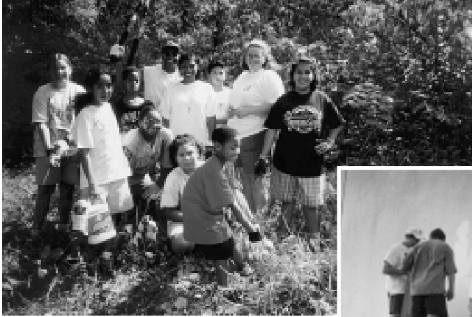
Arlington Teen Center kids do yard work for older residents.

out” is used to discipline a child whose behavior is disruptive. Staff are unambiguously instructed to locate a time out close to the activity in which the infraction occurred. During the time out, the disciplined children are required to sit quietly with their legs crossed and their hands folded in their laps until they are calm enough to rejoin the activity.