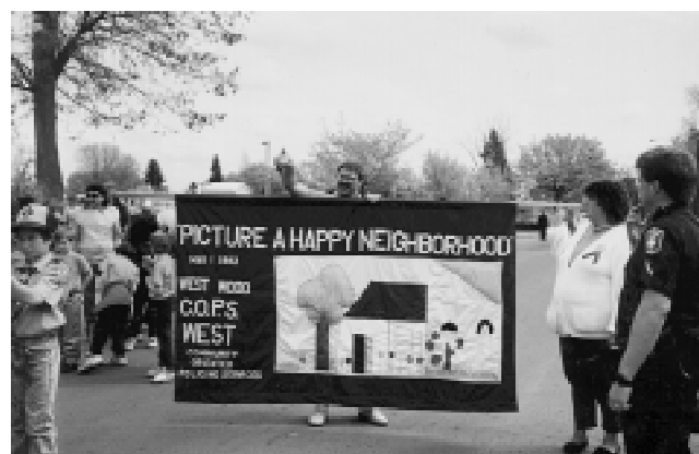
“COPS West Neighbor Days” parade features quilt made by COPS West volunteers from an elementary school student's design.

Key to Spokane's community policing approach is the chief's strong encouragement of actions by officers that go well beyond traditional law enforcement and crime prevention approaches, particular those addressing problems involving Spokane's children and teens. As a result of the motivation