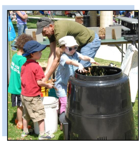
City of Thousand Oaks Compost Workshop

The City has enjoyed an active backyard composting program since 1992. Educational information to help residents get started and answer common questions about composting is available on the City website. The City also presents free composting workshops at annual Arbor-Earth Day events and offers a 40-minute video workshop on the City website and through TOTV. Residents are educated on preventing organic material (yard trimmings and food scraps) from entering the waste stream by composting at the point of generation.