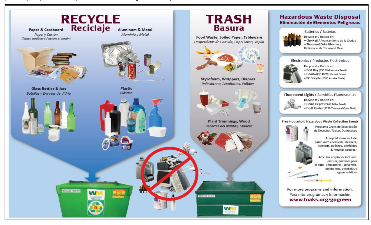
Figure 2: City of Thousand Oaks 2013/2014 Multifamily Recycling Guidelines Brochure

Two types of service are available to multifamily communities in Thousand Oaks to meet the State recycling mandate: multifamily commercial dumpster service or multifamily cart service. The type of service received depends on the unique space and capacity characteristics of each community. Multifamily commercial service provides centrally-located dual-stream dumpsters where community residents deposit trash and recyclables. Multifamily cart service provides two 64-gallon carts, one for trash and one for recyclable materials and weekly curbside collection. Recent additions to the franchised hauler agreement expand multifamily residential service to include bulky item pickup options equivalent to single-family residential service.