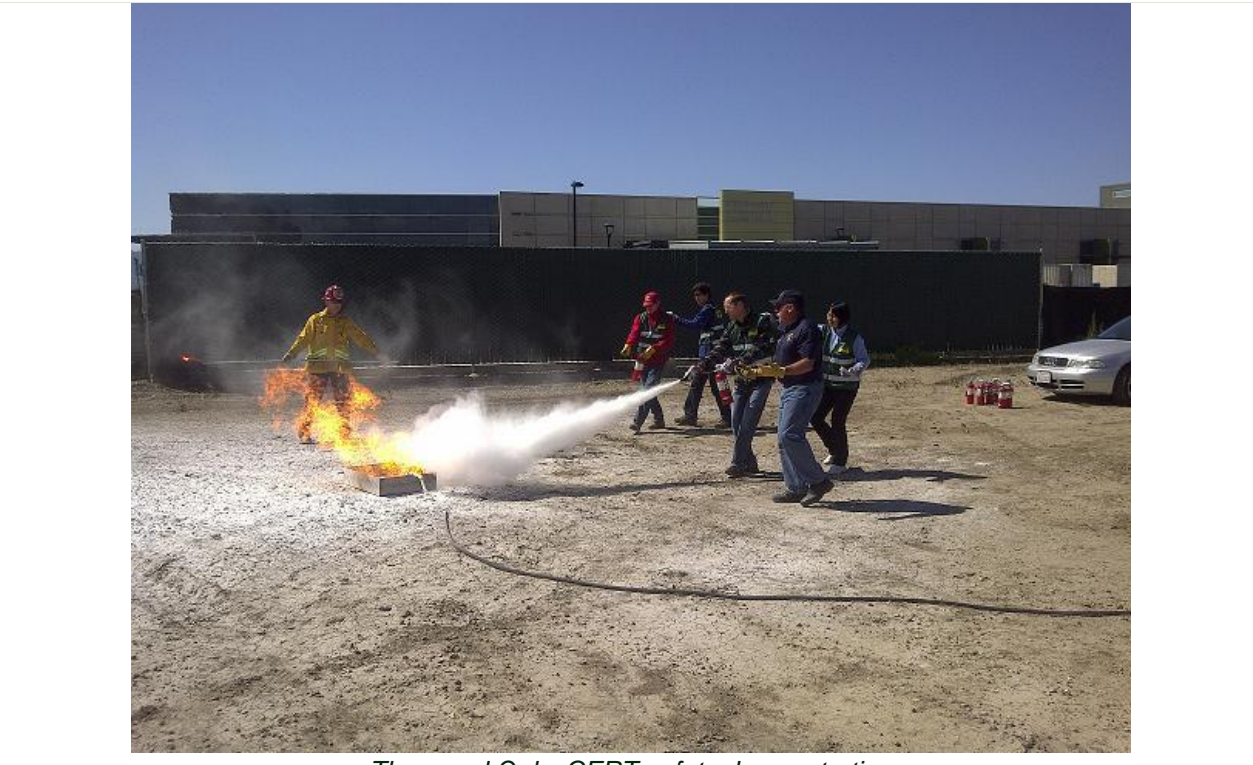
Thousand Oaks CERT safety demonstration