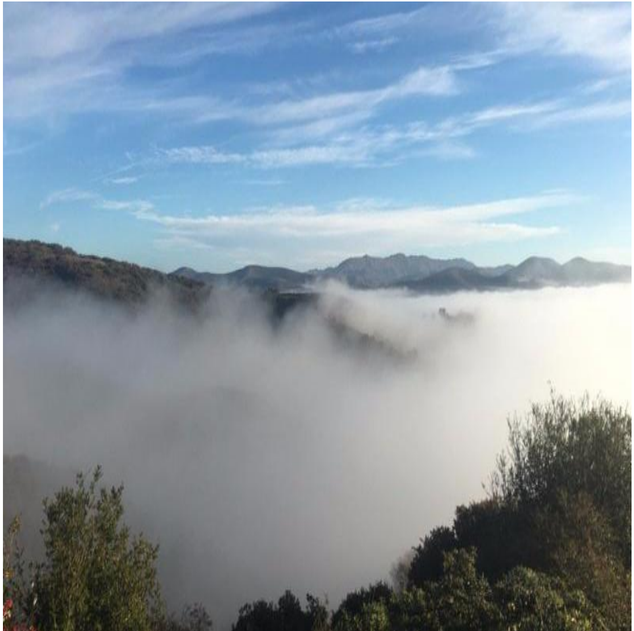
February's Featured Photo: